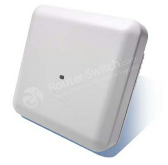
Figure 1 shows the face of AIR-AP2802I Model.